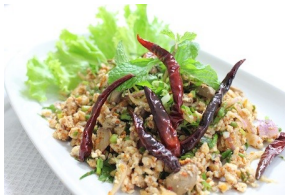
SL6. LARB CHICKEN SALAD