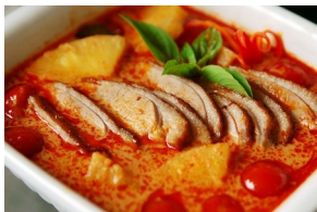
HS4. ROAST DUCK CURRY