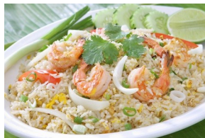
FR1. SHRIMP FRIED RICE