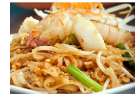
FN1. PAD THAI SHRIMP