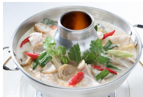
SU4. TOM KHA GAI LARGE