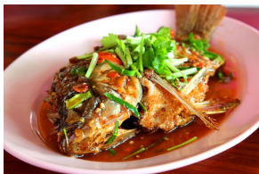
HS11. 3FLAVOR FISH